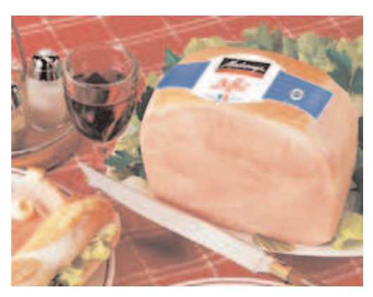
MP3021 Madrange Le Buffet Ham 2/6 lb

Madrange hams have fewer calories than beef and more protein than chicken at 1 gram of fat per serving. These hams belong in any upscale restaurant or store, and they blow Boar's Head right out of the cooler! In saying that, Madrange ham is more expensive because you are not paying for water. This is a great upscale sandwich meat, especially popular as the main ingredient on a sandwich or Panini. Slice it thin and leave the fat on for a truly wonderful flavor.