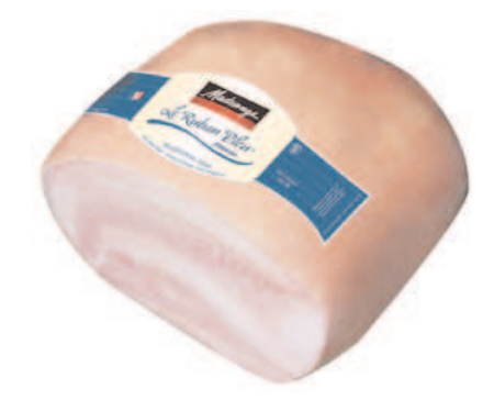
MP3020 Madrange French Ham 1/16.5 lb