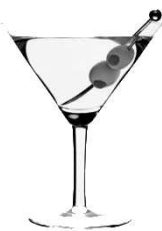
Table olives are big business in this country, and not just in terms of volume. Market studies have shown that olives generate the third highest profit margins of all grocery items, placing behind Spices and Extracts (#2) and Candy and Gum (#1). Interestingly, however, olives are not generally considered by consumers to be a supermarket staple. In fact, 81% of all olive sales are the result of impulse purchase.

Given that information, one may reasonably conclude that in the olive business, as in real estate, location is everything . It has been proven that when olives are conspicuously displayed at the store level, for instance at the end of aisles or near the checkout, sales can increase up to 5 times . In-store displays of olives can generate increased sales of related items, such as pickled vegetables, olive oils and cheeses. If simply placing the olives in visible locations can be that influential to sales, just imagine what a demo could do! Something as simple as a passive sampling display could be enough to ignite a spark in the consumer’s brain: “Don’t forget the olives!”