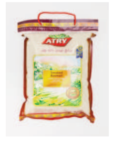
883657 Atry Smoked Basmati Rice 1/10 lb