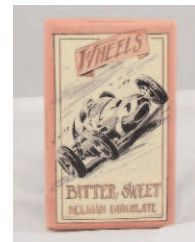
470722 Wheels Bitter Sweet Chocolate Bar 24/3.53 oz