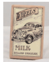
470733 Wheels Milk Chocolate Bar 24/3.53 oz