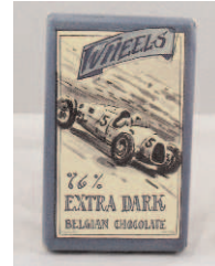
470711 Wheels 76% Extra Dark Chocolate Bar 24/3.53 oz