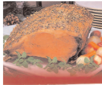
550917 Ribeye Beef Choice Natural 1/15 lb

Bite after bite, this product will not let you down!