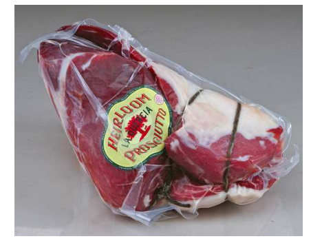
3545466 Prosciutto Rossa Heirloom Culaccia 1/8-10 lb

La Quercia strives to offer a memorable eating experience, seeking out the best possible ingredients, produced responsibly & crafted by hand into something that expresses an appreciation for the bounty and beauty of Iowa.