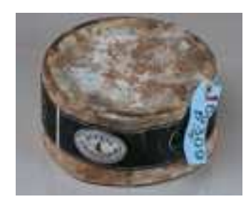
7065075 Cloth Wrapped Double Gloucester Truckle