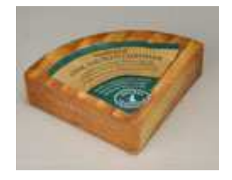
5770049 Oak Smoked Cheddar Wedge 1/3.3 lb