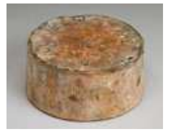
7065057 Cloth Wrapped Red Leicester Truckle