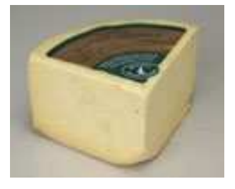
6417145 Mature Farmhouse Cheddar Wedge

Get her amazing cheese and taste a bit of history!