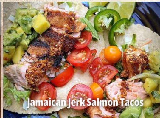
Jamaican Jerk Salmon Tacos