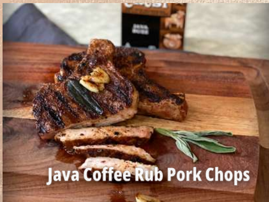
Java Coffee Rub Pork Chops