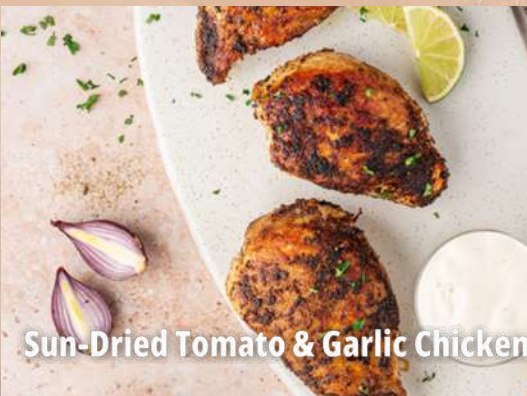
Sun-Dried Tomato & Garlic Chicken