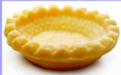
1685861 1.75" Fluted Shell 1/240 ct

We are pleased to announce that we are stocking a selection of sweet and neutral tart shells from Alba. Known formerly as Hafner, they offer a variety of high quality kosher and non-kosher products.