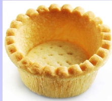
2006423 2" Fluted Kosher Shell 1/140 ct