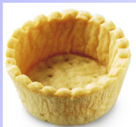
7003761 2" Kosher Fluted Shell 1/140 ct