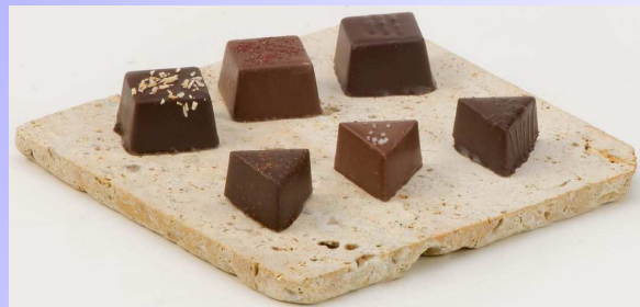
3855477 Assorted Caramel Bonbons 1/192 ct