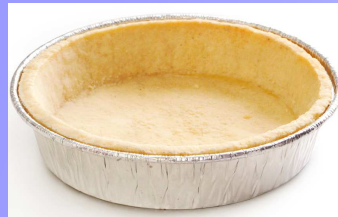
1685856 5" Quiche Shell with tin 1/54 ct