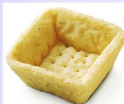
2006460 1.5" Square Kosher Shell 1/378 ct