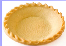
4034694 3.15" Fluted Shell 1/192 ct