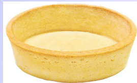
4034684 3.75" Straight Sided Shell 1/72 ct