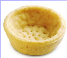
2006456 1.5" Round Kosher Shell 1/240 ct