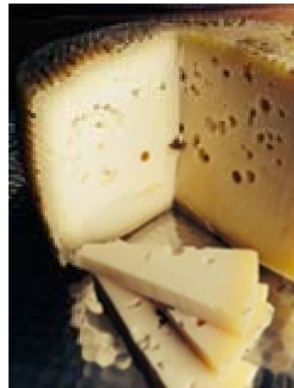
3448737 Haymaids 1/4.5 lb

This mild, semi-soft, natural rind cheese is inspired by cheeses traditionally hailing from the European Alpine region. Aged six to eight weeks, Haymaids has sweet tones, a subtle nutty flavor, and small eye development, similar to an Emmenthal or Jarlsberg cheese.