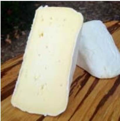
3448700 Trillium 6/8 oz

A triple cream, mold ripened cheese inspired by the French classics – Camembert and Brie. It has a soft creamy texture, with rich smooth flavors and gentle lactic tones. It ages three to eight weeks, ripening gracefully from the outside to the center.