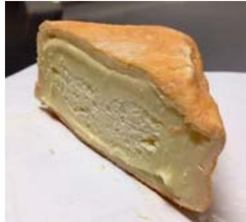
3448741 Foxglove 6/8 oz

This double cream, washed rind cheese has a soft consistency and earthy, more pungent flavors created by cultures and local porter beer applied on the distinctive reddish-colored rind. If you have trouble choosing between a Taleggio and an Epoisses, this cheese may hit the spot. It ages from four to eight weeks.