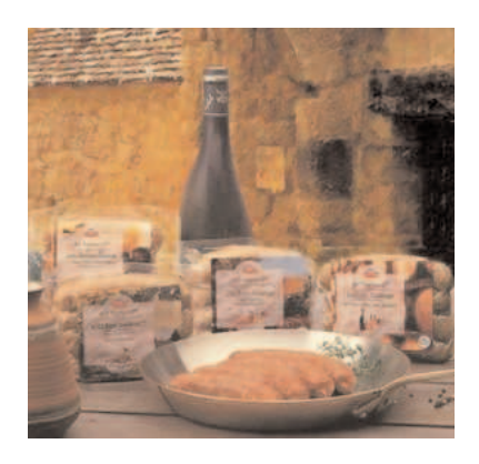
601788 Chateau Royal Buffalo w/Chipotle Sausage 12/12 oz

Chateau Royal introduces Buffalo with Chipotle Chiles to their line of gourmet game sausages. This amazing sausage with its southwestern flavors and heat from smoked jalapenos makes for an excellent introduction to buffalo. This hand crafted sausage's distinctive flavor profile comes from its unique and exciting, all natural ingredients. The buffalo (or American bison) is farm raised, and USDA inspected and processed in a USDA facility. Chateau Royal sausages are all natural without added chemicals, hormones, steroids, antibiotics or artificial additives.