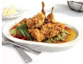
Nutritional Value of Edible Meats

To the educated food consumer the word rabbit might conjure a different image as its meat is growing in popularity. Why you ask? Here are a few good reasons. Rabbit meat is a good source of protein. Ounce for ounce rabbit is higher in protein than any other domesticated animal.