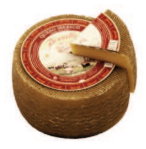
0811877 Iberico Young 2/7 lb

This firm cheese is mild, yet tasty and aromatic. It has a smooth, lactic aromatic and creamy flavor. Great diced into salad and drizzled with extra virgin olive oil, sliced on crusty bread with some fresh fruit on the side, pairs well with cured meats, such as chorizo and Serrano ham. As an appetizer, Iberico thrills in the company of chilled fino Sherry.