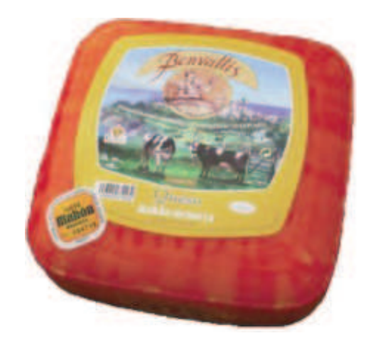
1691249 Mahon DOP Young 2/6 lb

Mahon DOP is produced with pasteurized milk of the Mahonesa, Frisona and Pardo-Alpina cows on the Mediterranean island of Menorca in the Balearics. Ripened in underground caves for at least 60 days. Mahon DOP has a bold, magnificent flavor that could never be called mild. The vellowish-orange rind conceals a soft, slightly salty and decidedly spicy interior. Traditionally the orange rind on Mahon comes from being rubbed in butter, paprika and olive oil. The intense, lightly salted, piquant flavor becomes more intense as the cheese ages. This unique cheese is a must try for any cheese lover and an absolute necessity for the true connoisseur. Serve before meals or after, as an appetizer or dessert, it can be melted and gives life to sandwiches or burgers, serve with crusty bread or crackers. Also ideal with nuts or fresh fruit such as grapes. If consumed with a sweet sherry, its personality and characteristics will be reinforced.