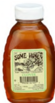
7411253 6/16Z Some Honey Clover Honey