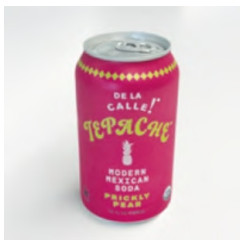
7439757 12/12Z De La Calle Prickly Pear Mexican Tepache Soda