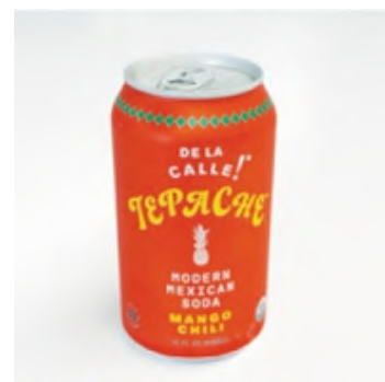
7169416 12/12Z De La Calle Mango Chili Mexican Tepache Soda

Questions? Contact our Sales Support Team 888-404-3828 319support@euroimp.sysco.com www.eiltd.com