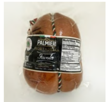
7452094 Palmieri Favola Riserva 1/2 Mortadella with Pistachio and Pigskin