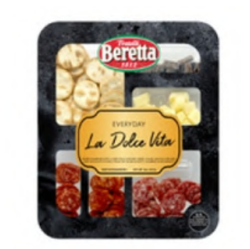
7439752 8/8Z Fratelli Beretta Everyday LaDolce Vita Platter (Yellow)