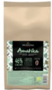
7454476 Valrhona Amatika 46% Vegan Chocolate Bean