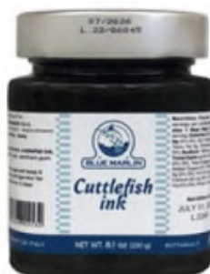
7441749 1/8Z Blue Marlin Cuttlefish Squid Black Ink