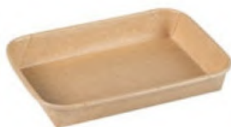
7442095 1/100CT Restaurantware MatsuriVision 8 oz Rectangle Kraft Paper Sushi Container