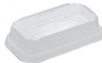
7442135 1/100CT Restaurantware Matsuri Vision Clear PET Lid - Fits 5oz Sushi Container