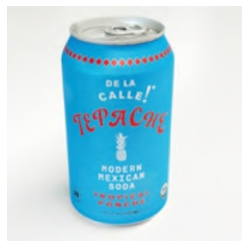
7439764 12/12Z De La Calle Tropical Punch Mexican Tepache Soda