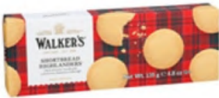
7411270 Walkers Shortbread Highlander Shortbread