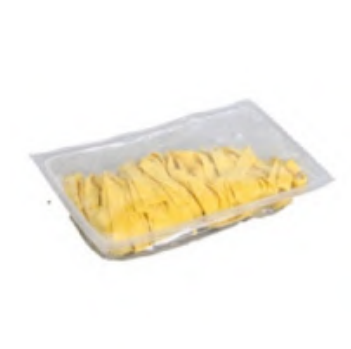
7078093 10/1# Mama Mucci's Pappardelle Egg Pasta

Questions? Contact our Sales Support Team 888-404-3828 319support@euroimp.sysco.com www.eiltd.com