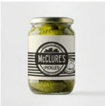
7450189 McClure's Pickles Garlic Dill Whole Pickles