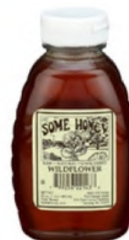
7411265 6/16Z Some Honey Wildflower Honey

Questions? Contact our Sales Support Team 888-404-3828 319support@euroimp.sysco.com www.eiltd.com