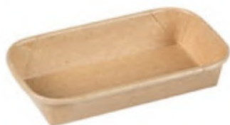
7442158 1/100CT Restaurantware MatsuriVision 5 oz Rectangle Kraft Paper Sushi Container