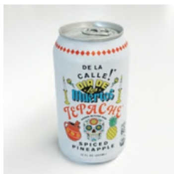
7169426 12/12Z De La Calle Pineapple Spice Mexican Tepache Soda

Hungry for something new? Check out the most recent products we've proudly added to our specialty food offerings.