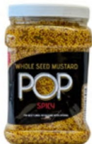
7418457 1/64Z POP Mustards Spicy Whole Seed Mustard 64oz