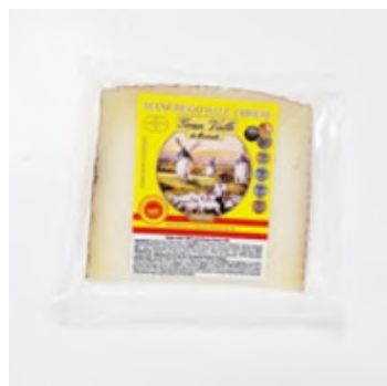
7418839 16/5.3Z Gran Valle de Montecelo Manchego Pasteurized Sheep Cheese 3 months EW