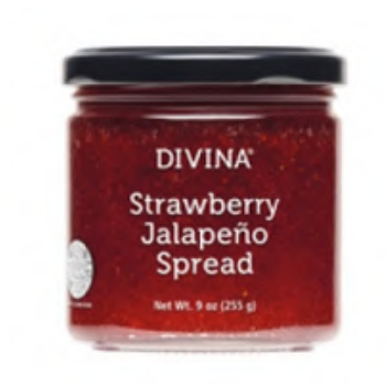
7416346 12/9Z Divina Strawberry Jalapeno Spread