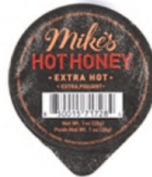
7389063 Mike's Hot Honey Hot Honey Extra Hot Dip Cups