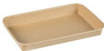
7442216 1/100CT Restaurantware MatsuriVision 15 oz Rectangle Kraft Paper Sushi Container