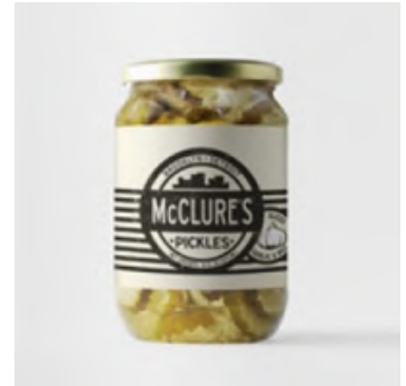
7450153 McClure's Pickles Garlic Dill Pickle Slices