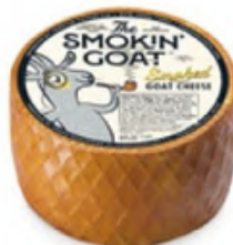
7443869 Mitica Smokin' Goat Cheese Wheel