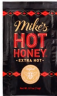
7377404 Mike's Hot Honey Extra Hot Honey Packets