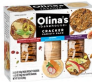
7443829 Olina's Bakehouse Cracker Variety Pack