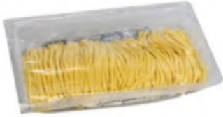
7441495 Mama Mucci's Linguine Egg Pasta

Hungry for something new? Check out the most recent products we've proudly added to our specialty food offerings.