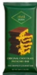
7441809 30/7.05Z Rah Dubai Original Chocolate Pistachio Bar 7.05oz