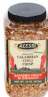
7443883 1/22Z Alessi Chili Crisp Flake 22oz