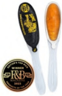
7433090 Some Honey Honey Spoon

Hungry for something new? Check out the most recent products we've proudly added to our specialty food offerings.