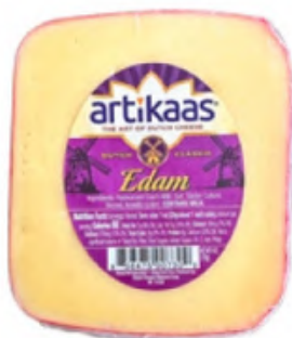
7443796 12/6Z Artikaas Edam Cheese EW Cut 6oz