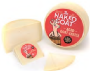
7443851 Mitica Naked Goat Cheese Wheel