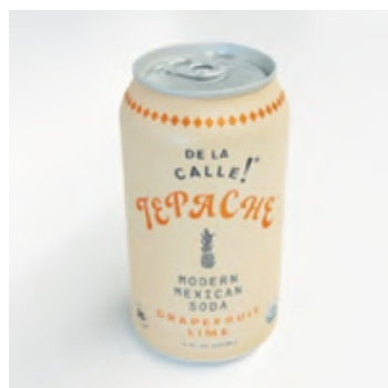
7439758 12/12Z De La Calle Grapefruit Lime Mexican Tepache Soda