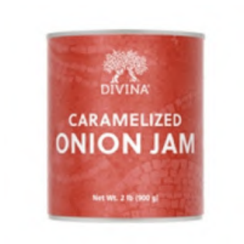
7382882 6/2# Divina Caramelized Onion Jam