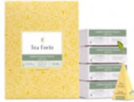
7419734 Tea Forte Green Mango Peach Tea Bulk Pack