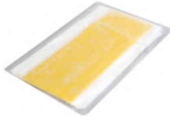
7441511 Mama Mucci's Ravioli Egg Pasta Sheets