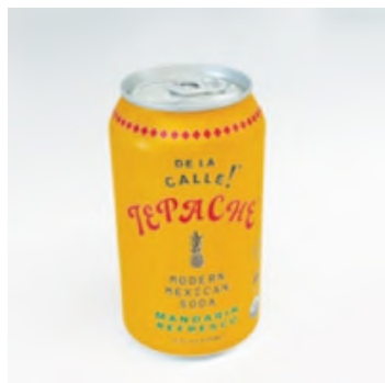
7440150 12/12Z De La Calle Mandarin Mexican Tepache Soda