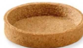
7364890 1/40CT Chef Inspired Pidy 4inches Coated Trendy Shell Round Graham