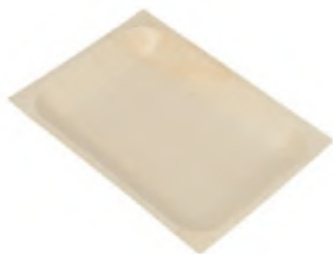
7416616 1/200CT Restaurantware Taipai Rectangle Natural Poplar Plate - 7" x 5" x 1/2"