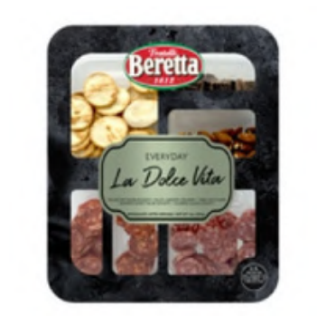
7439747 8/8Z Fratelli Beretta Everyday LaDolce Vita Platter (Green)