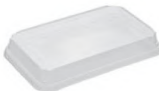
7442129 1/100CT Restaurantware Matsuri Vision Clear PET Plastic Lid - Fits 15 oz Sushi Container