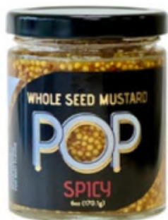
7418450 12/6Z POP Mustards Spicy Whole Seed Mustard 6oz

Hungry for something new? Check out the most recent products we've proudly added to our specialty food offerings.