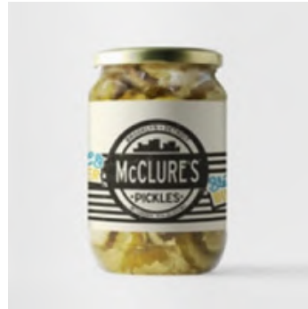
7450142 McClure's Pickles Bread & Butter Coin Cut Slices