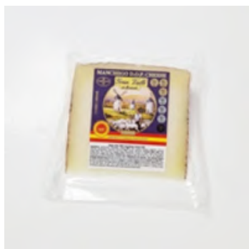
7418836 16/5.3Z Gran Valle de Montecelo Manchego Pasteurized Sheep Cheese 12 months EW