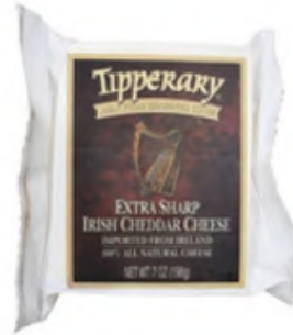
7453507 Tipperary Extra Sharp Irish Cheddar